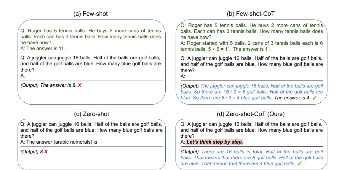
Figure 1: Example inputs and outputs of GPT-3 with (a) standard Few-shot ([Brown et al., 2020]), (b) Few-shot-CoT ([Wei et al., 2022]), (c) standard Zero-shot, and (d) ours (Zero-shot-CoT). Similar to Few-shot-CoT, Zero-shot-CoT facilitates multi-step reasoning (blue text) and reach correct answer where standard prompting fails. Unlike Few-shot-CoT using step-by-step reasoning examples per task , ours does not need any examples and just uses the same prompt "Let's think step by step" across all tasks (arithmetic, symbolic, commonsense, and other logical reasoning tasks).

In contrast to the excellent performance of LLMs in intuitive and single-step system-1 [Stanovich and West, 2000] tasks with task-specific few-shot or zero-shot prompting [Liu et al., 2021b], even language models at the scale of 100B or more parameters had struggled on system-2 tasks requiring slow and multi-step reasoning [Rae et al., 2021]. To address this shortcoming, Wei et al. [2022], Wang et al. [2022] have proposed chain of thought prompting (CoT), which feed LLMs with the step-by-step reasoning examples rather than standard question and answer examples (see Fig. 1-a). Such chain of thought demonstrations facilitate models to generate a reasoning path that decomposes the complex reasoning into multiple easier steps. Notably with CoT, the reasoning performance then satisfies the scaling laws better and jumps up with the size of the language models. For example, when combined with the 540B parameter PaLM model [Chowdhery et al., 2022], chain of thought prompting significantly increases the performance over standard few-shot prompting across several benchmark reasoning tasks, e.g., GSM8K (17.9% \rightarrow 58.1%).