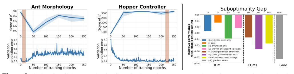
Figure 3: Left: Visualizing our checkpoint selection scheme on two tasks, and no matter the best checkpoint happens at the beginning or end of the training, our strategy based on validation in-distribution MSE could capture the best performance. Right : Offline tuning vs oracle uniform online tuning for IOM, COMs and Gradient-ascent. Among all the methods, IOM achieves the smallest regret for offline tuning, and our specific tuning strategy works best compared with other tuning strategies for IOM.