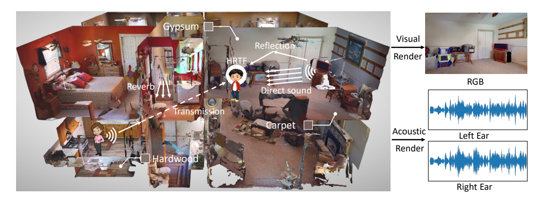
Figure 1: Illustration of SoundSpaces 2.0 rendering in a multi-room multi-floor HM3D [56] environment. In this scenario, a boy is watching TV in the living room while his mom calls him to have dinner from the kitchen downstairs. We model various frequency-dependent acoustic phenomena for sound propagation from all sources (TV and mom) to him, including direct sound, reflection, reverb, transmission, diffraction and air absorption. The sound propagation is based on a bidirectional path-tracing algorithm that takes the geometry of the scene as well as materials of objects in the space as input. The received sound is spatialized to binaural with the head-related transfer function (HRTF). As a result, SoundSpaces 2.0 renders the visual and audio observations with spatial and acoustic correspondence . For example, the TV being situated more towards the right results in right-ear signals that are stronger than those in the left ear.

pursued for physical models [9], gaming [43] and auralization for architectural design [75], typically restricted to simple parametric geometries and in isolation from visual context.