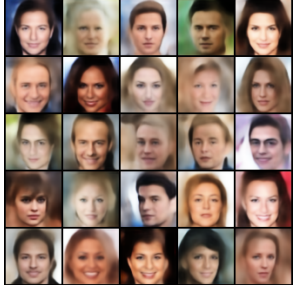
Figure 2: Samples generated with JIIO on a small MDEQ network.