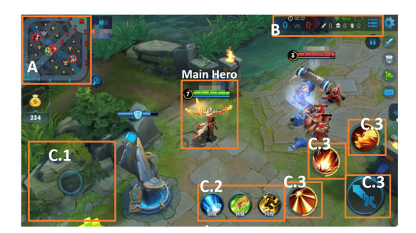
Figure 2: Game UI of Honor of Kings . The hero controlled by the player is called "main hero". Bottom-left is the movement controller (C.1), while the right-bottom set of buttons are ability controllers (C.2, C.3). Players can observe game situations via the screen (local view), obtain game states with dashboard (B), and obtain a global view with the top-left mini map (A).

Table 4: Heroes constructing the lineups.