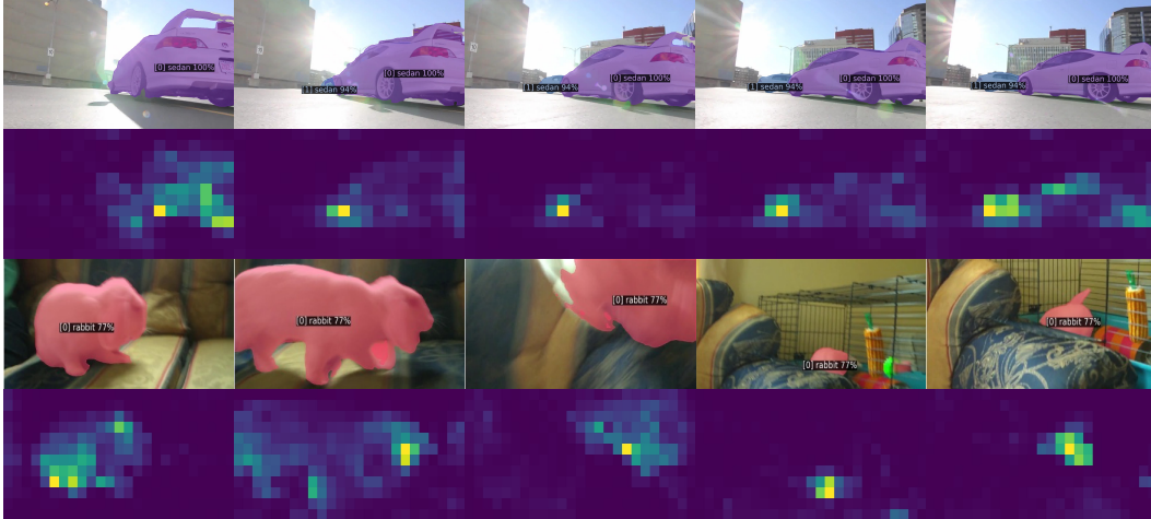
Figure 3: Visualizations of results and attention maps of memory tokens.

the unified MT tokens as a whole. Compared to the unified insertion, the decomposition brings better accuracy as the memories of same indices have more correspondences, which ease the encoders to build attentions in between.