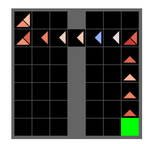
Figure 3: Example of a heatmap made based on scores. Colour from least to most important are blue, white and red. (a) Our heatmap based on the Tarantula measure, showing all the states an agent encounters while walking to the goal, including the direction in which the agent was facing. For example, in the top left grid location, we show the importance of the state in which the agent is facing right, and the state in which it is facing down.

A Different Default Action Not all environments have an obvious default action. In this case, a straightforward choice is to set the default action to "take a random action". We measured the effect of this choice by running the same experiments with the changed default action, and detailed results are available in the full version of this paper [22]. The results are similar or slightly worse to the ones obtained with the default action "repeat the previous action". In most games, the difference was small ( \leq 10\% ); a few games show a marginal improvement. These results indicate that the choice of a default action has no effect on our conclusions.