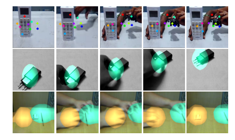
Figure 3: Nodes' regions on Smt-Smt-V2. We show (1st row) the center of all the N regions as predicted by DyReg-GNN (each color for a node). Each node region (last 2 rows) corresponds to a zone from the latent conv features pooled by a node.