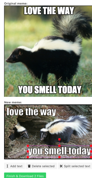
Figure 3: Custom interface for meme reconstruction.

The annotator was shown the original meme and asked to reproduce it as faithfully as possible using the new underlying image, focusing on the preservation of semantic content. Some memes consist of multiple background images, in which case these were first vertically stacked and provided as a single image to the user. The annotators stored the resultant meme in PNG and SVG formats (the latter gives flexibility for potentially moving or augmenting the text, as well as extracting it or removing it altogether).