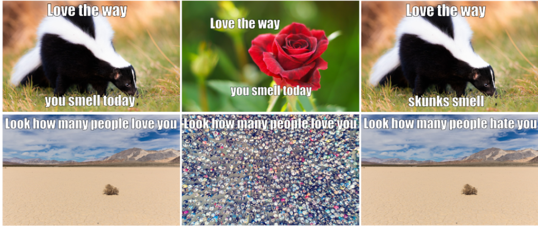
Figure 1: Multimodal “mean” memes and benign confounders, for illustrative purposes (not actually in the dataset; featuring real hate speech examples prominently in this place would be distasteful). Mean memes (left), benign image confounders (middle) and benign text confounders (right).

illustration. That is to say, memes are often subtle and while their true underlying meaning may be easy for humans to detect, they can be very challenging for AI systems.