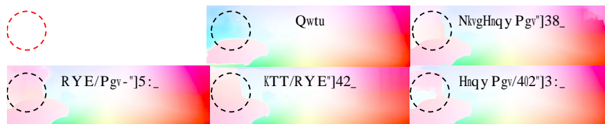
Figure 2: Results on KITTI-15 test image 48. Color indicates the direction and magnitude of the displacements following Middlebury color wheel, as shown in the top-left image. While prior methods predict the dark wall (circled) as moving to the right together with the front vehicle, our method correctly predicts it as moving to the left.

19 Qualitative comparisons (R1) For other baselines besides PWC-Net+, we show qualitative results of a challenging 20 example from KITTI-15 test set in Fig. 2. We will add more qualitative results to the main paper and project website.