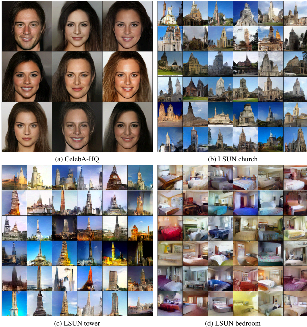
Figure 3: (a) 5-bit 256 \times 256 CelebA-HQ samples with temperature 0.7; (b)(c)(d) 5-bit 128 \times 128 LSUN church, tower and bedroom samples, with temperature 0.9, respectively.