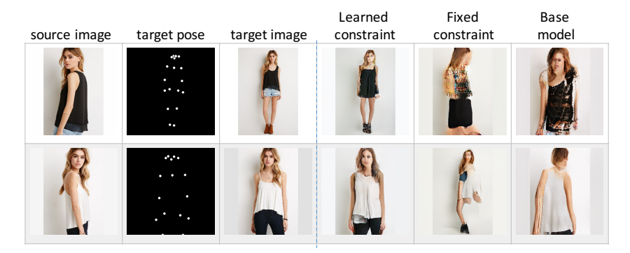
Figure 3: Samples generated by the models in Table 2. The model with learned human part constraint generates correct poses and preserves human body structure much better.