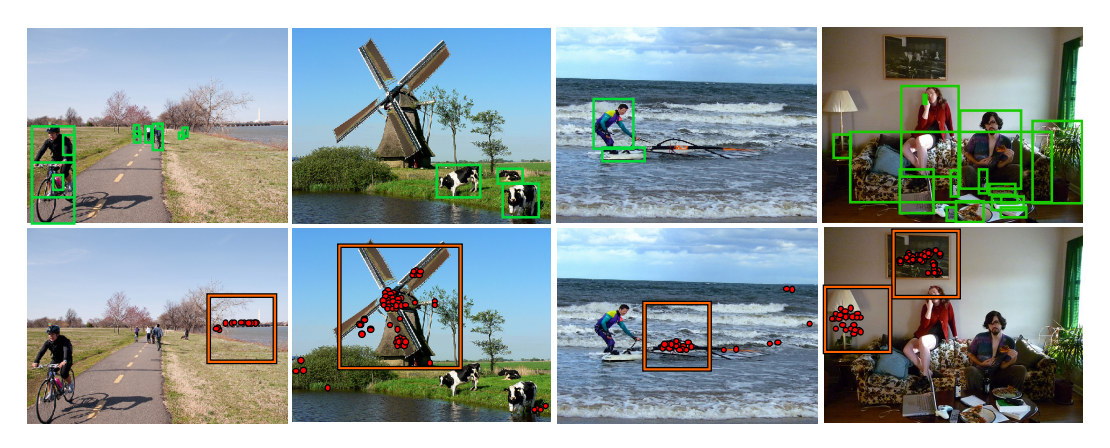
Figure 2: SNIPER negative chip selection. First row: the image and the ground-truth boxes. Bottom row: negative proposals not covered in positive chips (represented by red circles located at the center of each proposal for the clarity) and the generated negative chips based on the proposals (represented by orange rectangles).

In this way, every ground-truth box is covered at the appropriate scale. Since the crop-size is much smaller than the resolution of the image ( i.e. more than 10x smaller for high-resolution images), SNIPER does not process most of the background at high-resolutions. This leads to significant savings in computation and memory requirement while processing high-resolution images. We illustrate this with an example shown in Figure 1. The left side of the figure shows the image with the ground-truth boxes represented by green bounding boxes. Other colored rectangles on the left side of the figure show the chips generated by SNIPER in the original image resolution which cover all objects. These chips are illustrated on the right side of the figure with the same border color. Green and red bounding boxes represent the valid and invalid ground-truth objects corresponding to the scale of the chip. As can be seen, in this example, SNIPER efficiently processes all ground-truth objects in an appropriate scale by forming 4 low-resolution chips.