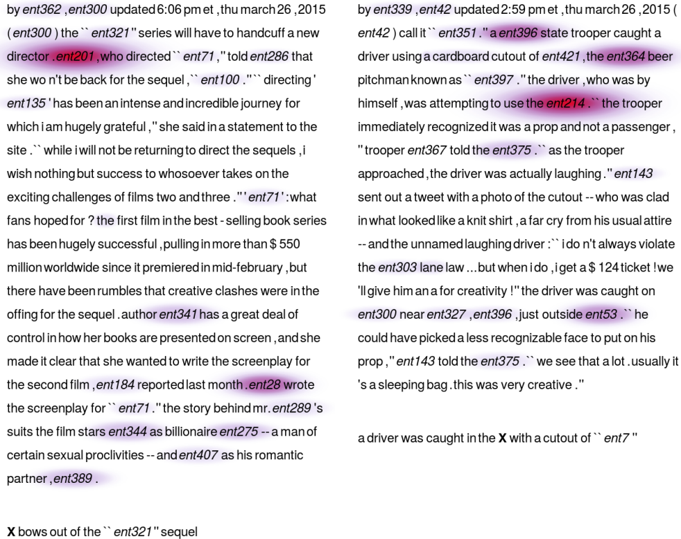
Figure 6: Attention heat maps from the Attentive Reader for two more correctly answered validation set queries. Both examples require significant lexical generalisation and co-reference resolution to find the correct answers ent201 and ent214 , respectively.

quoted, which is non-trivial in the context document. The final positive example (also in Figure 7) demonstrates the fearlessness of our model.