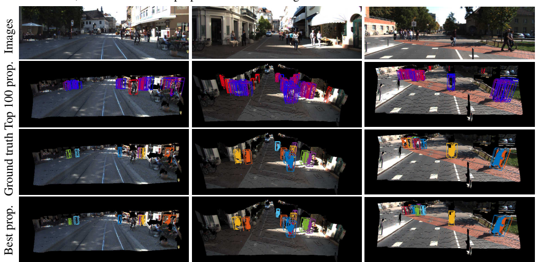
Figure 5: Qualitative examples for the Pedestrian class.