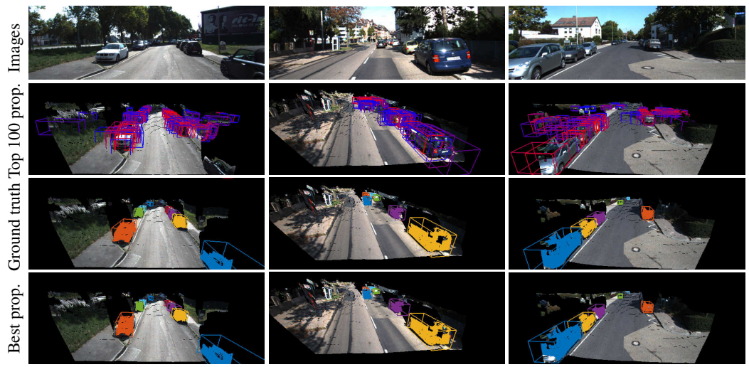
Figure 4: Qualitative results for the Car class. We show the original image, 100 top scoring proposals, ground-truth 3D boxes, and our best set of proposals that cover the ground-truth.