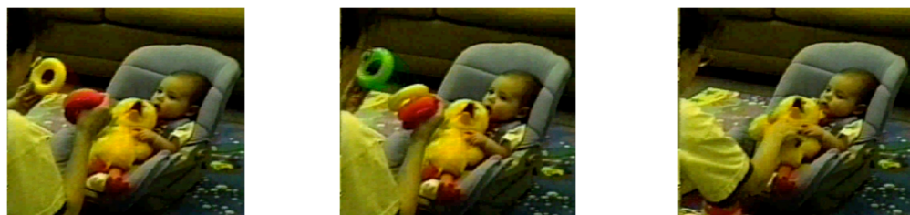
Corpus data from CHILDES annotated with objects