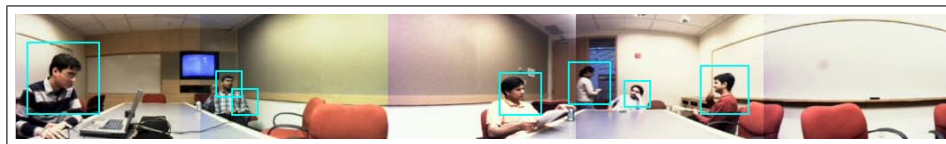
Figure 4: One example from the testing dataset and overlaid results.

We compared classical AdaBoost with two variants of MIL boost: ISR and Noisy-OR. For the MIL algorithms there is one bag for each labeled head, containing those positive windows which overlap that head. Additionally there is one negative bag for each image. After training, performance is evaluated on held out conference video (see Figure 3).