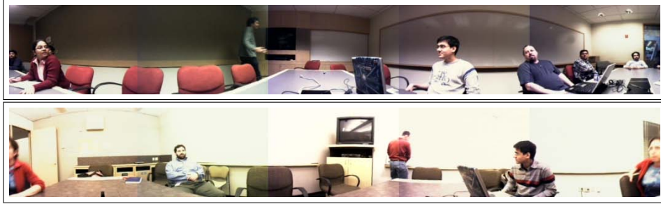
Figure 1: Two example images with people in a wide variety of poses. The algorithm will attempt to detect all people in the images, including those that are looking away from the camera.