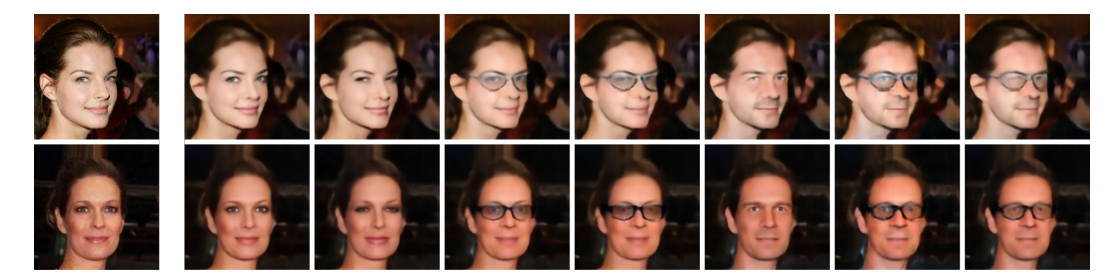
Figure 4: (Zoom in for better resolution.) Examples of multi-attribute swap (Gender / Opened eyes / Eye glasses) performed by the same model. Left images are the originals.

Quantitative results In the naturalness experiments, only around 90% of real images were classified as "real" by the Workers, indicating the high level of requirement to generate natural images. Our model obtained high naturalness accuracies when reconstructing images without swapping attributes: 88.4%, 75.2% and 78.8%, compared to IcGAN reconstructions whose accuracy does not exceed 23%, whether it be for reconstructed or swapped images. For the swap, FADNET SWAP still consistently outperforms ICGAN SWAP by a large margin. However, the naturalness accuracy varies a lot based on the swapped attribute: from 79.0% for the opening of the mouth, down to 31.4% for the smile.