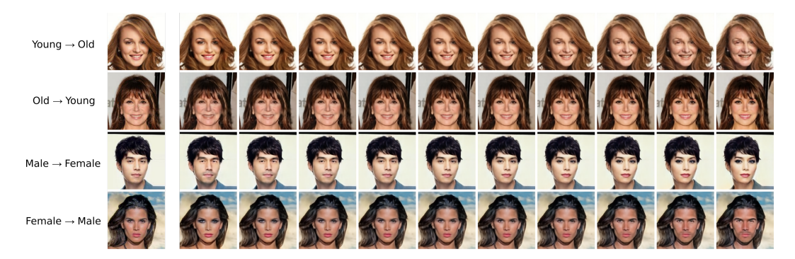
Figure 1: Interpolation between different attributes (Zoom in for better resolution). Each line shows reconstructions of the same face with different attribute values, where each attribute is controlled as a continuous variable. It is then possible to make an old person look older or younger, a man look more manly or to imagine his female version. Left images are the originals.

The fundamental feature of our approach is to constrain the latent space to be invariant to the attributes of interest. Concretely, it means that the distribution over images of the latent representations should be identical for all possible attribute values. This invariance is obtained by using a procedure similar to domain-adversarial training (see e.g., [21, 6, 15]). In this process, a classifier learns to predict the attributes y given the latent representation z during training while the encoder-decoder is trained based on two objectives at the same time. The first objective is the reconstruction error of the decoder, i.e., the latent representation z must contain enough information to allow for the reconstruction of the input. The second objective consists in fooling the attribute classifier, i.e., the latent representation must prevent it from predicting the correct attribute values. In this model, achieving invariance is a means to filter out, or hide, the properties of the image that are related to the attributes of interest. A single latent representation thus corresponds to different images that share a common structure but with different attribute values. The reconstruction objective then forces the decoder to use the attribute values to choose, from the latent representation, the intended image.