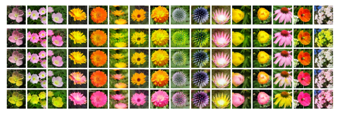
Figure 5: Examples of reconstructed flowers with different values of the pink attribute. First row images are the originals. Increasing the value of that attribute will turn flower colors into pink, while decreasing it in images with originally pink flowers will make them turn yellow or orange.

We performed additional experiments on the Oxford-102 dataset, which contains about 9,000 images of flowers classified into 102 categories [17]. Since the dataset does not contain other labels than the flower categories, we built a list of color attributes from the flower captions provided by [19]. Each flower is provided with 10 different captions. For a given color, we gave a flower the associated color attribute, if that color appears in at least 5 out of the 10 different captions. Although being naive, this approach was enough to create accurate labels. We resized images to 64 \times 64 . Figure 5 represents reconstructed flowers with different values of the "pink" attribute. We can observe that the color of the flower changes in the desired direction, while keeping the background cleanly unchanged.