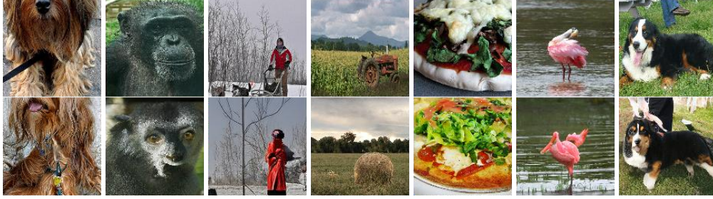
Figure 2: Selected reconstructions from an unsupervised BigBiGAN model (Section 3.3). Top row images are real data \mathbf{x} \sim P_{\mathbf{x}} ; bottom row images are generated reconstructions of the above image \mathbf{x} computed by \mathcal{G}(\mathcal{E}(\mathbf{x})) . Unlike most explicit reconstruction costs (e.g., pixel-wise), the reconstruction cost implicitly minimized by a (Big)BiGAN [5, 8] tends to emphasize more semantic, high-level details. Additional reconstructions are presented in Appendix B (supplementary material).

that these results differ from those in Table 1 due to the use of the data augmentation method of [23] 6 (rather than ResNet-style preprocessing used for all results in our Table 1 ablation study). The lighter augmentation from [23] results in better image generation performance under the IS and FID metrics. The improvements are likely due in part to the fact that this augmentation, on average, crops larger portions of the image, thus yielding generators that typically produce images encompassing most or all of a given object, which tends to result in more representative samples of any given class (giving better IS) and more closely matching the statistics of full center crops (as used in the real data statistics to compute FID). Besides this preprocessing difference, the approaches in Table 3 have the same configurations as used in the Base or High Res \mathcal{E} (256) row of Table 1.