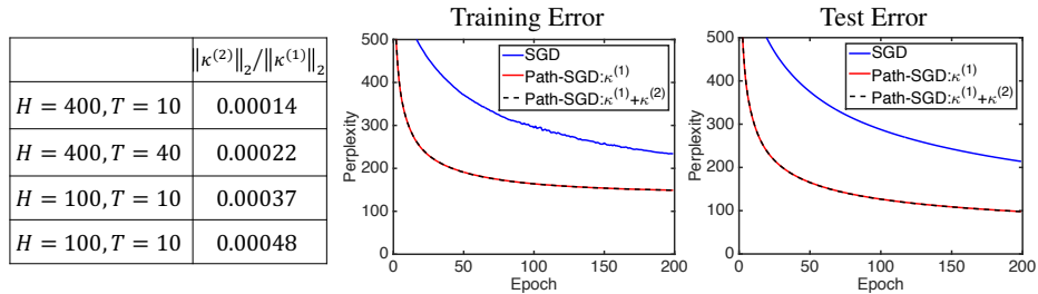
Figure 2: Path-SGD with/without the second term in word-level language modeling on PTB. We use the standard split (929k training, 73k validation and 82k test) and the vocabulary size of 10k words. We initialize the weights by sampling from the uniform distribution with range [-0.1, 0.1]. The table on the left shows the ratio of magnitude of first and second term for different lengths T and number of hidden units T. The plots compare the training and test errors using a mini-batch of size 32 and backpropagating through T = 20 time steps and using a mini-batch of size 32 where the step-size is chosen by a grid search.