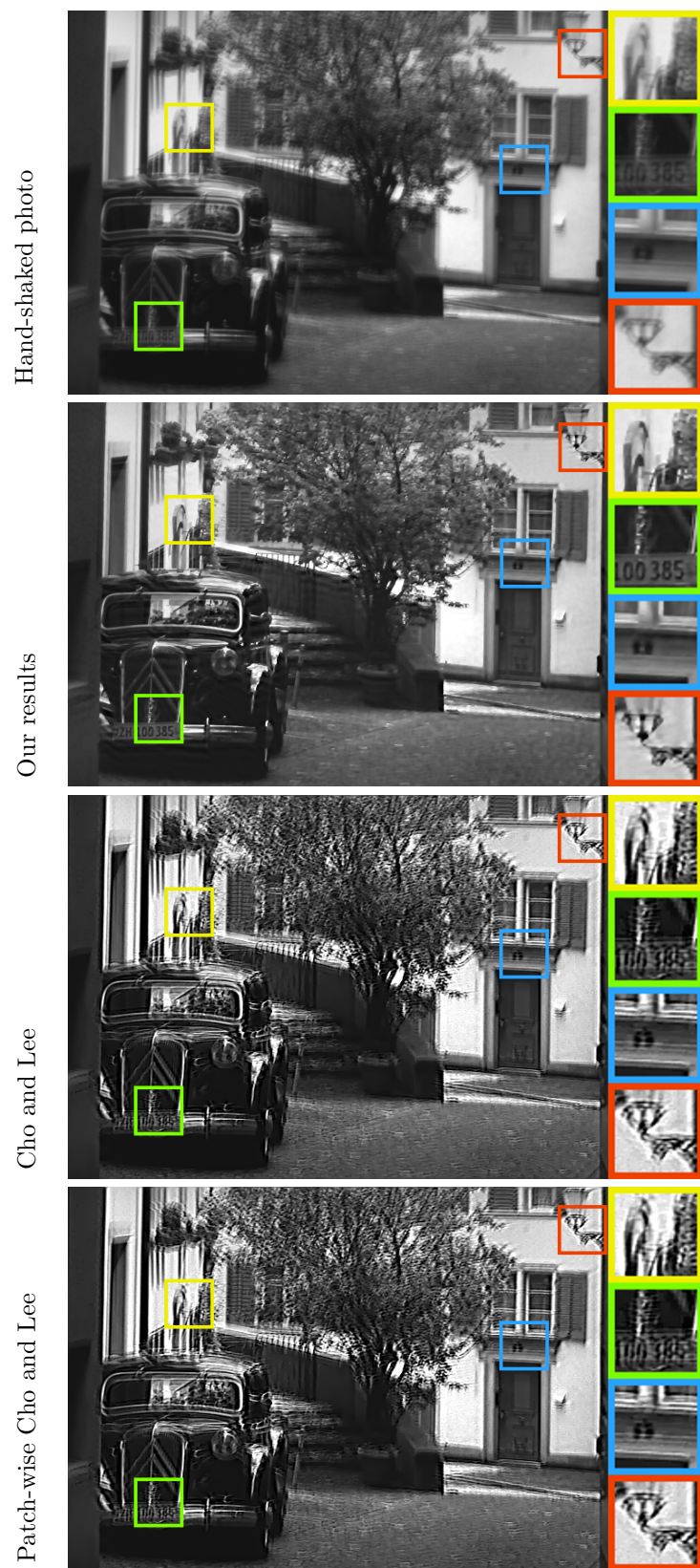
Figure 1: Vintage Car: Blurry image and comparison of deblurring results.