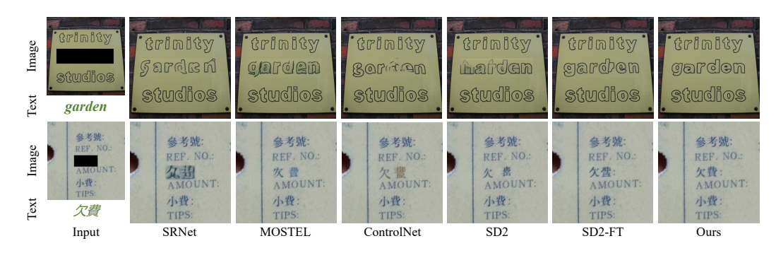
Figure 1: Examples of text editing. DiffUTE achieves the best result among existing models.

Numerous studies formulate scene text editing as a style transfer task and approach it by generative models like GANs Wu et al. [2019], Qu et al. [2023]. Typically, a cropped text region with the target style is needed as the reference image. Such methods then transfer a rendered text in the desired spelling to match the reference image's style and the source image's background. However, the two major challenges for scene text editing remains. (i) These methods are currently constrained to editing English and fail to accurately generate complex text style (e.g., Chinese). (ii) The process of cropping, transferring style and blending results in less natural-looking outcomes. End-to-end pipelines are needed for the consistency and harmony.