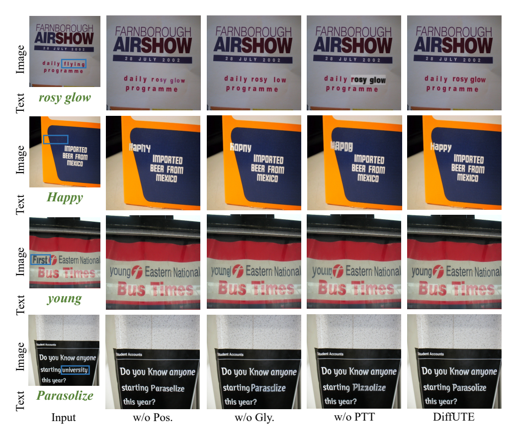
Figure 4: Sample results of ablation study.