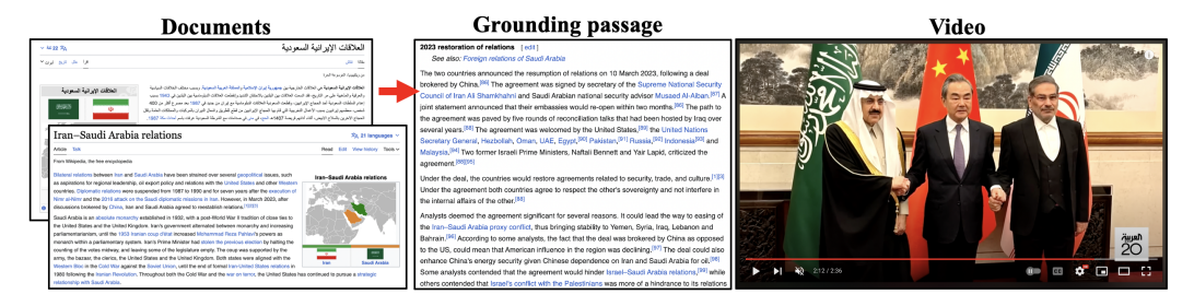
Figure 1: A sample video-text pair from MultiVENT. Every event-centric video is paired with a corresponding video description and a long-form text document describing the event, both in the same language as the video. If the language is not English, the video is also paired with a corresponding English document.

بعد جولات من الحوار رعتها بغداد وسلطنة عمان لتكللها الصين بفتح باب جديد.. الاتفاق بين السعودية وإيران على إعادة العلاقات الدبلوماسية وفتح السفارات في البلدين Translation: After rounds of dialogue sponsored by Baghdad and the Sultanate of Oman, China crowned it with the opening of a new door... The agreement between Saudi Arabia and Iran to restore diplomatic relations and open embassies in the two countries.