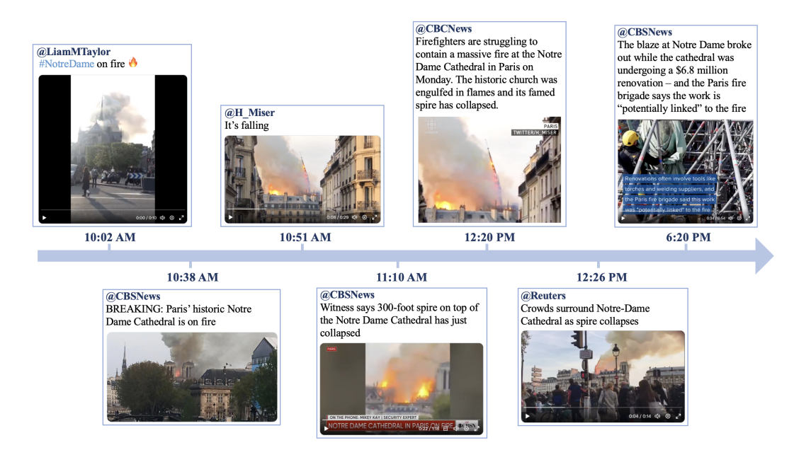
Figure 3: Snapshot of video news coverage of the 2019 Notre Dame fire news cycle (an event in MultiVENT). The fire and the fallen spire were initially reported through first-person social media video uploads (at 10:02 AM and 10:51 AM, respectively) and then later broadcast by news organizations in more detail (10:38 AM, 11:10 AM, 12:20 PM, 12:26 PM). Some news coverage (12:20 PM) directly used first-person social media footage (10:51 AM). Hours later, news agencies uploaded more complete news stories with details and context (6:20 PM). This data suggests that it is important for models to learn from both first-person videos and official news coverage at various points in the news cycle to fully construct a factual model of the event, especially if the model is attempting to construct an event model while information develops online.

cycles for slowly unfolding events and for sudden, unexpected events that take time to assess. This is illustrated in Figure 3, which shows a snapshot of the 2019 Notre Dame fire news cycle and demonstrates how unedited and poorly curated footage, often first-person witness accounts on social media, can be instrumental in the construction of our collective understanding of events. So, we propose that teaching models to understand different video formats, despite clear discrepancies in the amount of information they present, is important for developing robust systems.