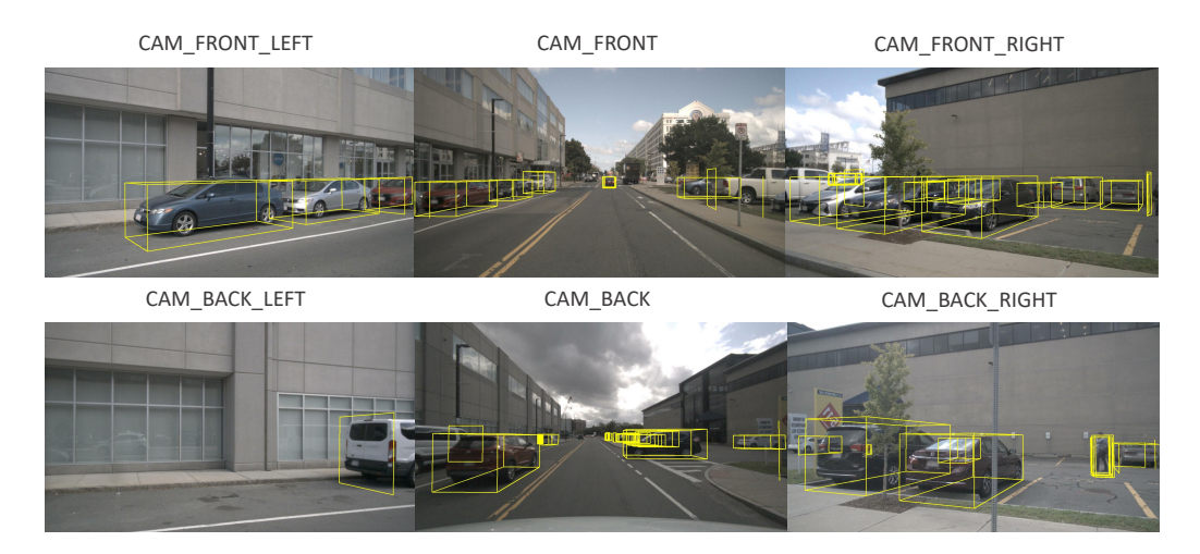
Figure 5: Visualization of the predictions for 3D object detection generated by the VCD-A.