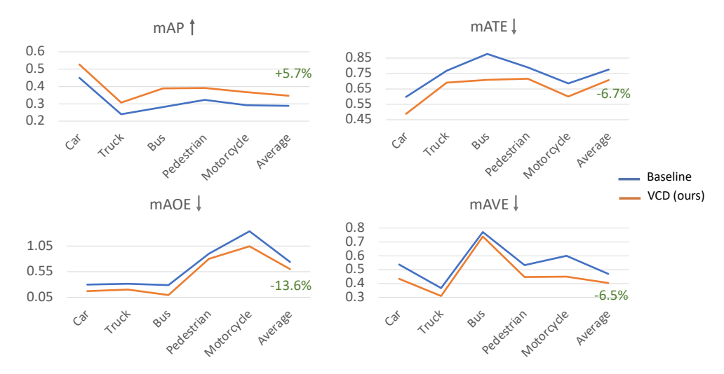
Figure 4: Effects of VCD on movable objects. Our distillation framework VCD consistently improves dynamic objects across a range of metrics.