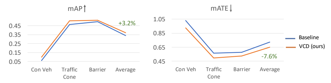
Figure 3: Effects of VCD on static objects. Our distillation framework VCD can still consistently improves static objects, demonstrating 3.2% and 7.6% improvements in precision-recall (mAP) and localization quality (mATE), respectively.