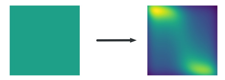
Figure 1: KR rearrangement T(z) = (T_1(z_1, z_2), T_2(z_1, z_2))^{\top} transports a uniform reference measure \nu^2 on the unit cube [0, 1]^2 to a multimodal distribution \mu (right).