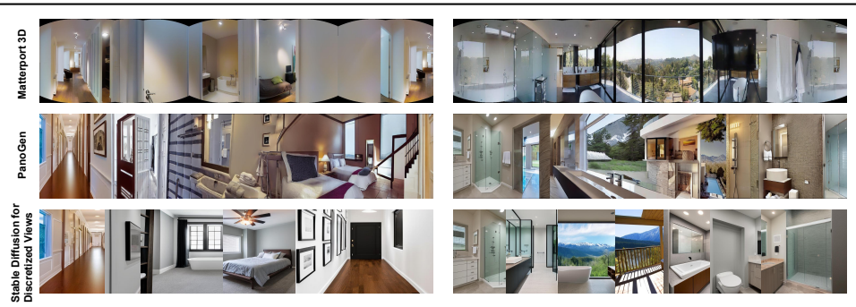
Figure 3: Qualitative analysis of the panoramic environments generated with our PANOGEN. "Matterport3D" is the original environment for VLN tasks. "Stable Diffusion for Discretized Views" is the concatenation of separately generated discretized views given text captions.