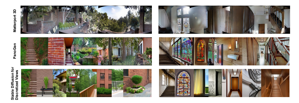
Figure 4: Qualitative analysis of the panoramic environments generated with our PANOGEN. "Matterport3D" is the original environment for VLN tasks. "Stable Diffusion for Discretized Views" is the concatenation of separately generated discretized views given text captions.

In our PANOGEN environments, we didn't explicitly constrain the consistency between views at different navigation steps. In this section, we show our initial exploration of improving the view consistency across steps. Specifically, we fine-tune instructpix2pix [5] based on sub-instruction annotations [19] to generate the next views given previous step in the trajectory. After generating consistent discrete views with instructpix2pix at different viewpoints, we then outpaint the view with our approach to create panoramic environments with better consistency across navigation steps. As shown in Table 9, we observe that