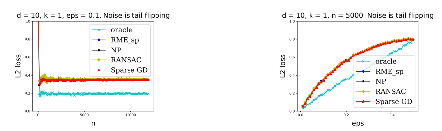
(a) Fix the sparsity k and change the number of samples n. (b) Fix n, k and change the fraction of corruption \epsilon . Figure 2: The performance of various algorithms in the tail-flipping noise model.