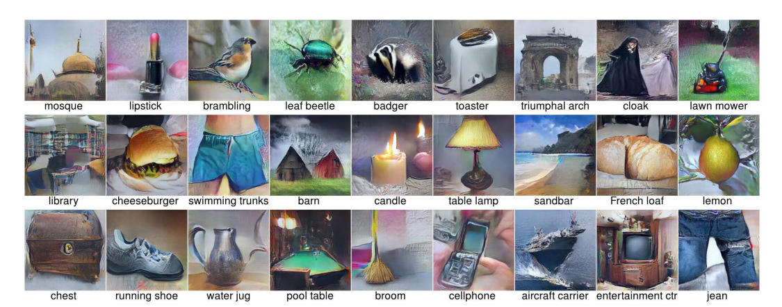
Figure 1: Images synthesized from scratch to highly activate output neurons in the CaffeNet deep neural network, which has learned to classify different types of ImageNet images.

'cares about' the grass, but if an image synthesized to highly activate the lawn mower neuron contains grass (as in Fig. 1), we can be more confident the neuron has learned to pay attention to that context.