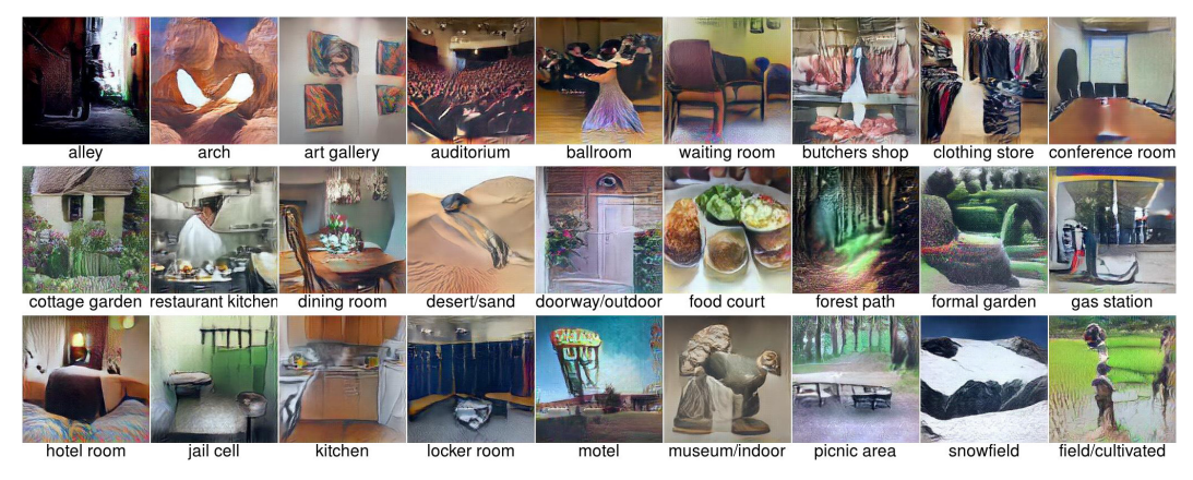
Figure 3: Preferred stimuli for output units of an AlexNet DNN trained on the MIT Places dataset [26], showing that the ImageNet-trained prior generalizes well to a dataset comprised of images of scenes.

Overall, the prior trained with a CaffeNet encoder generalizes well to visualizing other DNNs of the same CaffeNet architecture trained on different datasets.