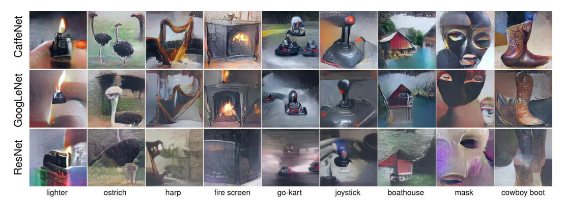
Figure 5: DGN-AM produces the best image quality when the DNN being visualized \Phi is the same as the encoder E (here, CaffeNet), as in the top row, and degrades when \Phi is different from E .

in architecture to CaffeNet than ResNet). An alternative hypothesis is that the network depth impairs gradient propagation during activation maximization. In any case, training a general prior for activation maximization that generalizes well to different network architectures, which would enable comparative analysis between networks, remains an important, open challenge.