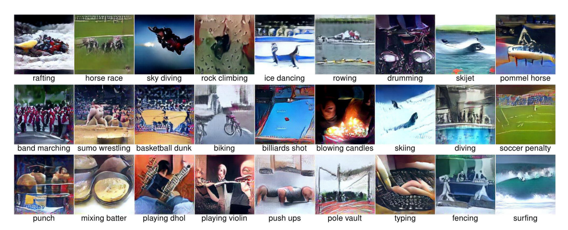
Figure 4: Preferred images for output units of a heavily modified version of the AlexNet architecture trained to classify videos into 101 classes of human activities [27]. Here, we optimize a single preferred image per neuron because the DNN only classifies single frames (whole video classification is done by averaging scores across all video frames).

in architecture to CaffeNet than ResNet). An alternative hypothesis is that the network depth impairs gradient propagation during activation maximization. In any case, training a general prior for activation maximization that generalizes well to different network architectures, which would enable comparative analysis between networks, remains an important, open challenge.