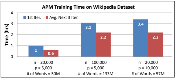
Figure 1: (left) The speedup on the BNC dataset shows that the algorithm scales approximately linearly with the number of workers because the subproblems are all independent. (right) The timing results on the Wikipedia dataset show that the algorithm scales to larger datasets and has a computational complexity of approximately O(np^2) .