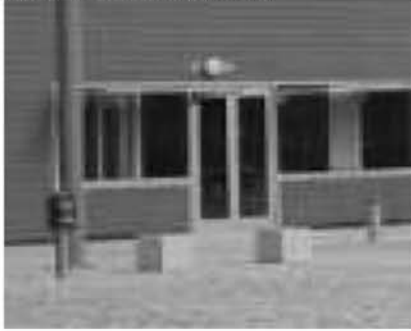
(a) Low-resolution image (1 of 16)