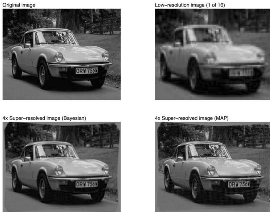
Figure 1: Example using synthetically generated data showing ( top left ) the original image, ( top right ) an example low resolution image and ( bottom left ) the inferred super-resolved image. Also shown, in ( bottom right ), is a comparison super-resolved image obtained by joint optimization with respect to the super-resolved image and the parameters, demonstrating the significantly poorer result.

In Figure 1(a) we show the original image, together with an example low resolution image in Figure 1(b). Figure 1(c) shows the super-resolved image obtained using our Bayesian approach. We see that the super-resolved image is of dramatically better quality than the low resolution images from which it is inferred. The converged value for the PSF width parameter is \gamma = 1.94 , close to the true value 2.0.