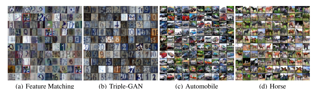
Figure 2: (a-b) Comparison between samples from Improved-GAN trained with feature matching and Triple-GAN on SVHN. (c-d) Samples of Triple-GAN in specific classes on CIFAR10.