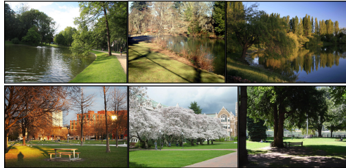
Figure 1: Images from SUN 397 [29] illustrating class ambiguity. Top: (left to right) Park, River, Pond. Bottom: Park, Campus, Picnic area.

As the number of classes increases, two important issues emerge: class overlap and multi-label nature of examples [9]. This phenomenon asks for adjustments of both the evaluation metrics as well as the loss functions employed. When a predictor is allowed k guesses and is not penalized for k - 1 mistakes, such an evaluation measure is known as top- k error. We argue that this is an important metric that will inevitably receive more attention in the future as the illustration in Figure 1 indicates.