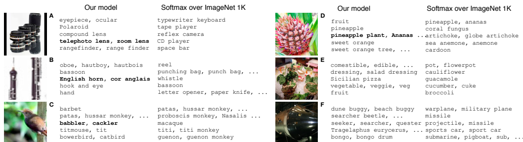
Figure 2: For each image, the top 5 zero-shot predictions of DeViSE+1K from the 2011 21K label set and the softmax baseline model, both trained on ILSVRC 2012 1K. Predictions ordered by decreasing score, with correct predictions in bold. Ground truth: (a) telephoto lens, zoom lens ; (b) English horn, cor anglais ; (c) babbler, cackler ; (d) pineapple, pineapple plant, Ananas comosus ; (e) salad bar ; (f) spacecraft, ballistic capsule, space vehicle .